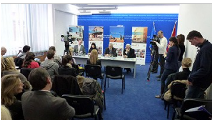
Press conference in Zagreb, 13 March, 2013