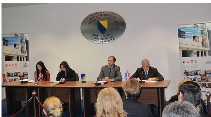
Press conference in Sarajevo, 3 April, 2013

The tailor-made national information campaigns, to last throughout the Programme implementation, are funded by the European Union and implemented by the leading implementing institutions in Partner Countries.