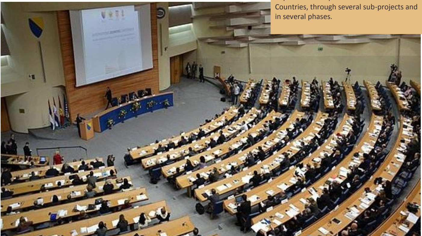
Donors' Conference held on 24 April 2012 in Sarajevo, Bosnia and Herzegovina

The RHP will comprise four Country Housing Projects, which will be implemented in parallel in the four Partner Countries, through several sub-projects and in several phases.