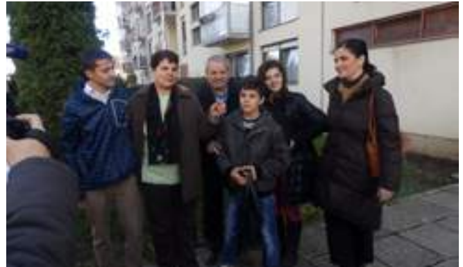
A family in Petrinja in front of their new apartment