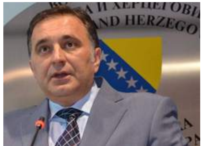
Mr Damir Ljubić, Minister of Human Rights and Refugees of Bosnia and Herzegovina

This first RHP sub-project will be implemented in the following municipalities and towns of the Federation of Bosnia and Herzegovina: Bosanski Petrovac, Bosansko Grahovo, Bugojno, Dobretici, Foca in FBiH, Gorazde, Hadzici, Stari grad Sarajevo and Vogosca, Olovo, Sanski Most, Travnik and Tuzla; and in the following municipalities and towns of Republika Srpska: Banja Luka, Brod, Derventa, Gradiska, Foca, Novo Gorazde, Prijedor, Srebrenica and Trebinje.