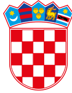
Republic of Croatia