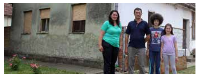
Beneficiary Family in Serbia

This sub-project's total cost is EUR 2.2 million and comprises the delivery of 66 prefabricated houses and 129 packages of building material. The first 25 packages, distributed in October last year, were financed by the Serbian contribution to Serbia's Country Housing Project.