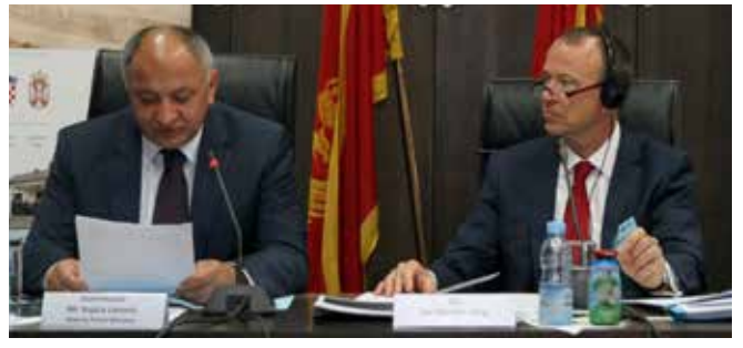
Mr Vujica Lazovic, Deputy Prime Minister of Montenegro and Mr Morten Jung, European Commission

The meeting participants also had a chance to see a regional RHP film and a photo exhibition of the RHP construction sites and beneficiary families, presenting the main Programme's results on the ground up to now.