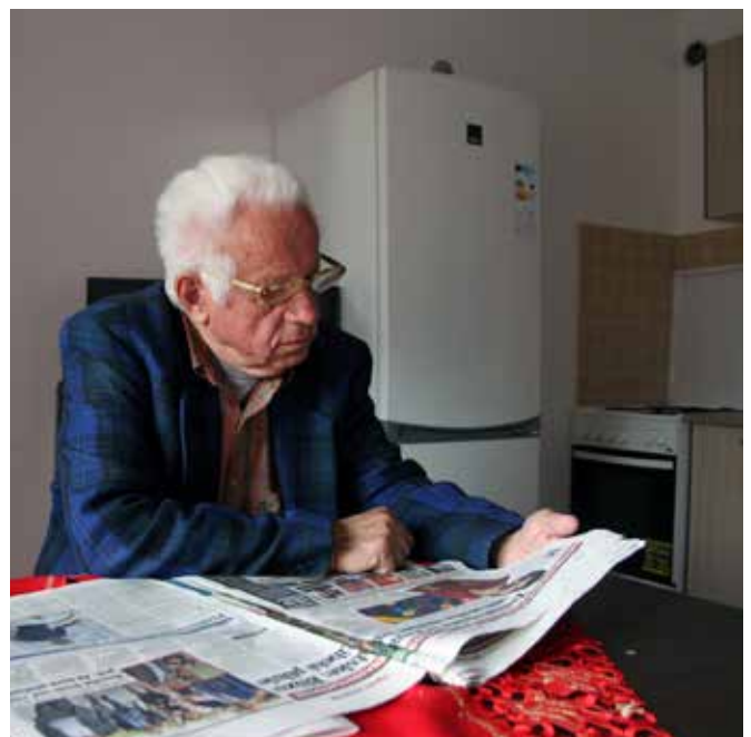
Left: Beneficiaries at the Korenica site to celebrate the launch of construction in June 2014. Right: In the new apartment, September 2015

Watch short films about beneficiaries on RHP Youtube channel