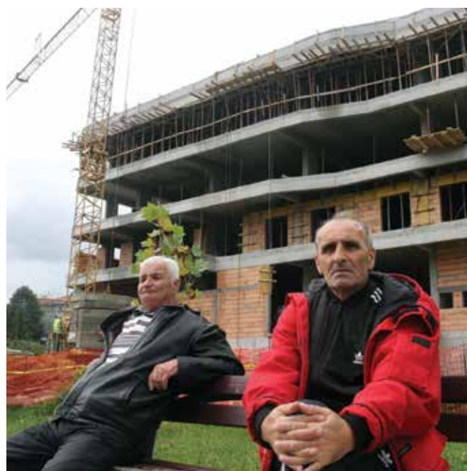
Inauguration of the finished building in Nikšić, June 2016. Right: Construction works on the home for the elderly in Pljevlja, October 2016 Watch short films about beneficiaries on RHP Youtube channel