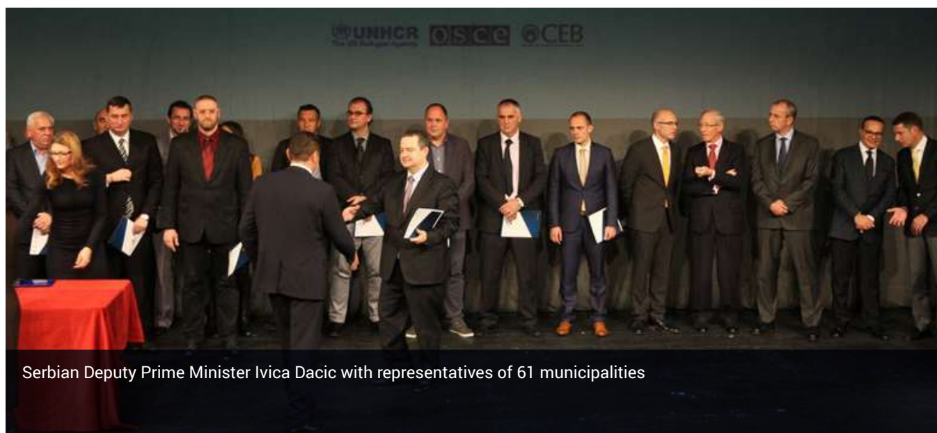
Serbian Deputy Prime Minister Ivica Dacic with representatives of 61 municipalities

In Montenegro, municipalities also play an important role in the implementation of the RHP. As in the other Partner Countries, municipalities have donated land and financed the costs of preparing the building sites and the provision of infrastructure. More importantly, municipalities also take in charge the ownership and maintenance of RHP-financed buildings. This is the case in the Konik Camp where 120 most vulnerable families who live in particularly dire living conditions will receive a housing solution. The municipality of Podgorica will have to operate the buildings after the construction is finished.