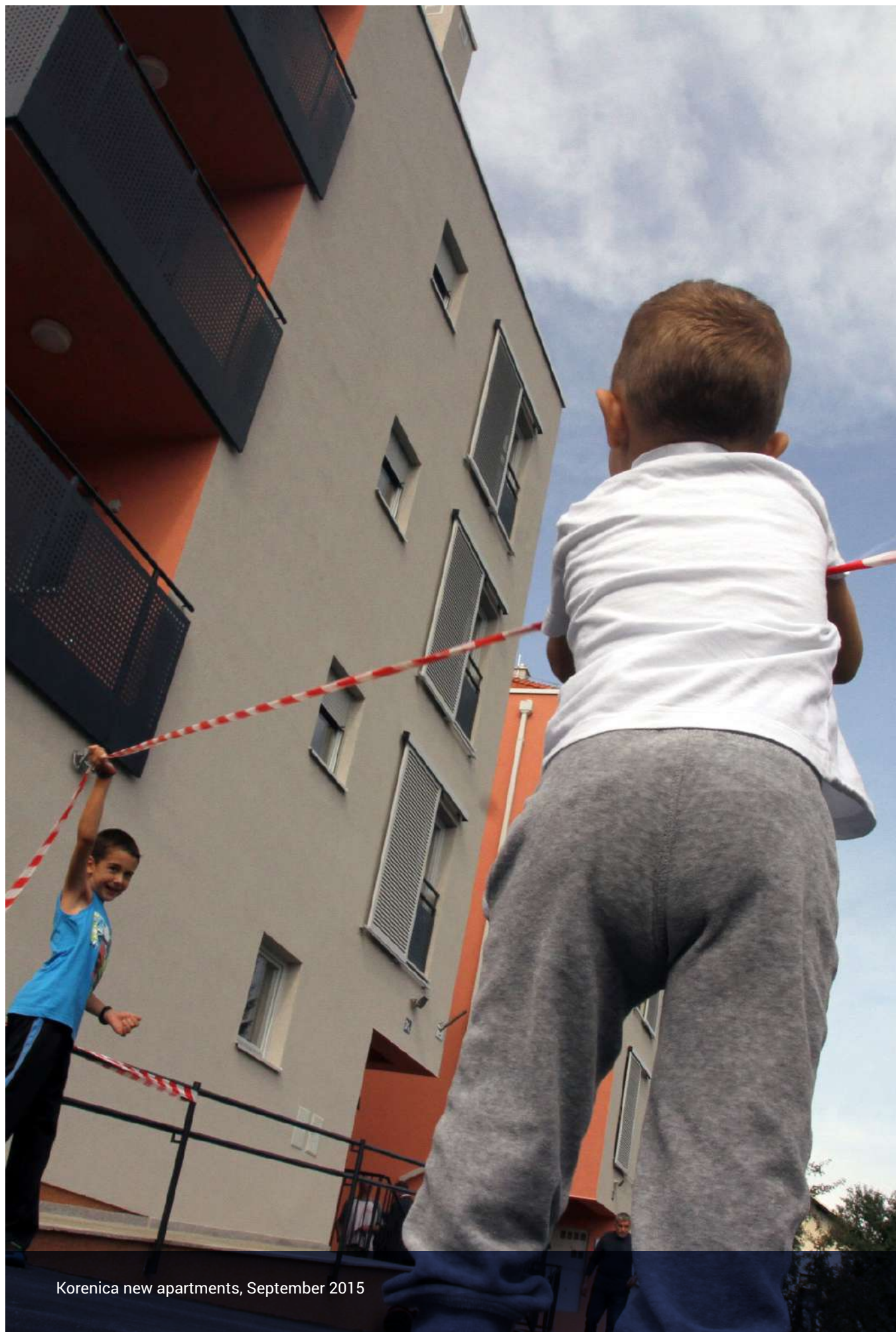
Korenica new apartments, September 2015