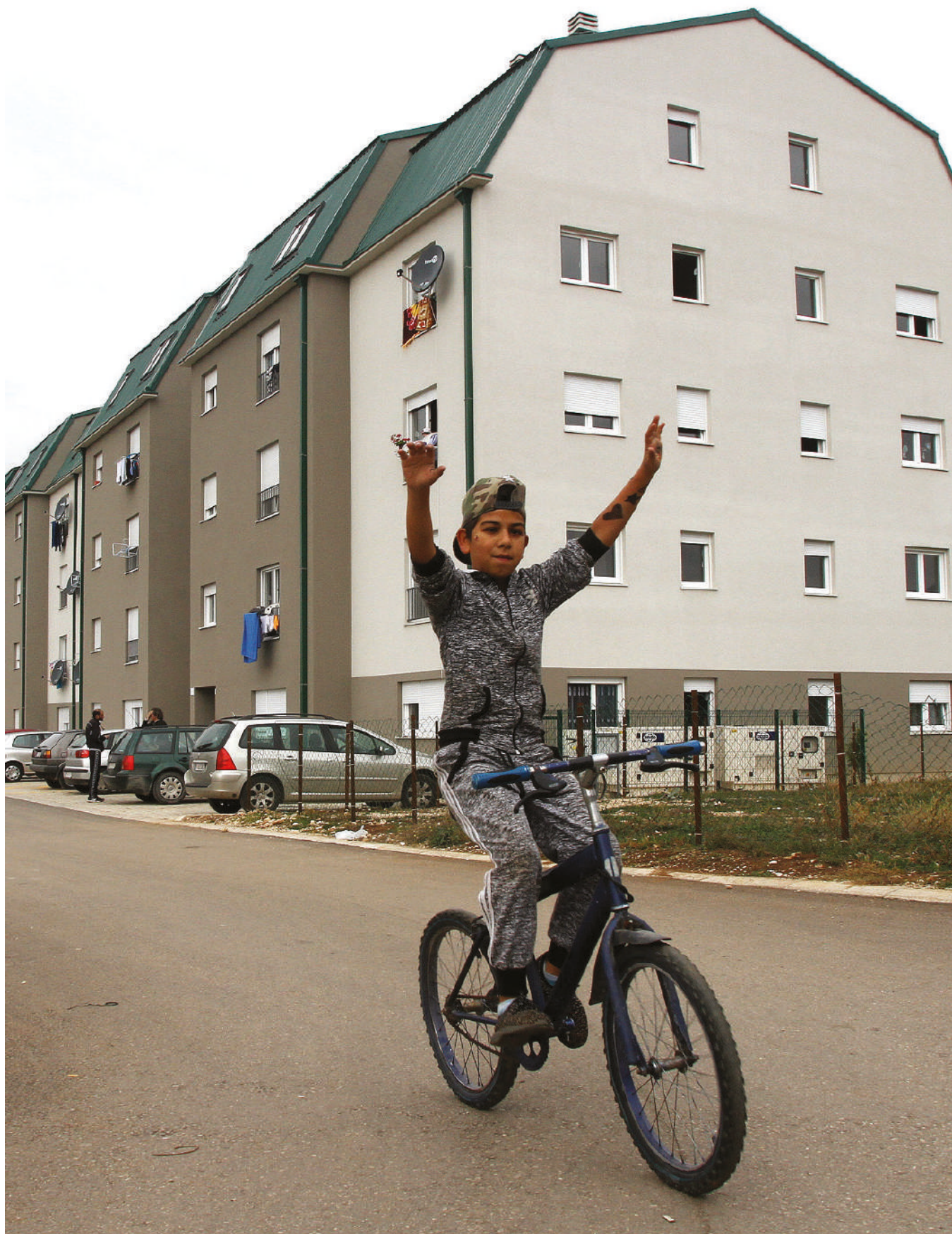
Finished building in Niksic, June 2016