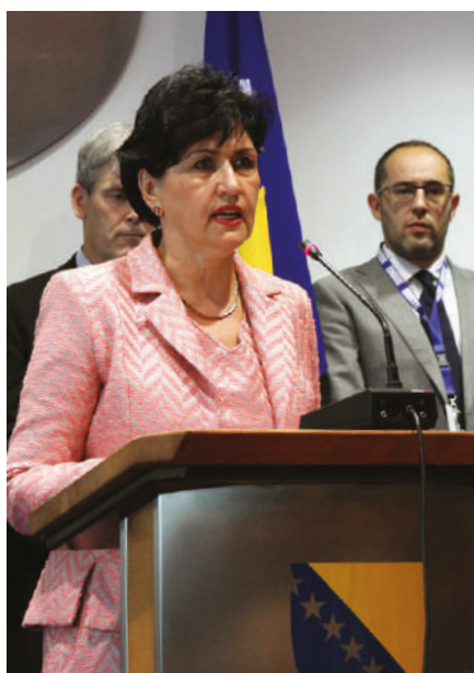
Minister Semiha Borovac

The Minister of Human Rights and Refugees of Bosnia and Herzegovina, Ms Semiha Borovac, summarised RHP's main results in her speech at the RHP Steering Committee meeting of 1 December 2016. In their joint statement, communicated by Minister Borovac, the four Partner Countries support with one voice the continuation of the RHP, with accent on its regional character which is of major importance not only for the return process but also for reconciliation and strengthening of good neighbourly relations in the region.