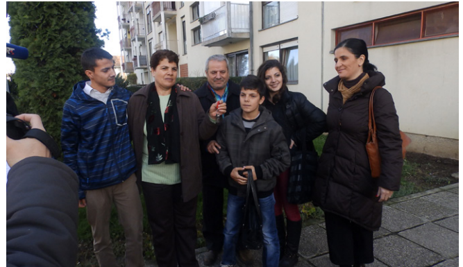
A family in Petrinja in front of their new apartment