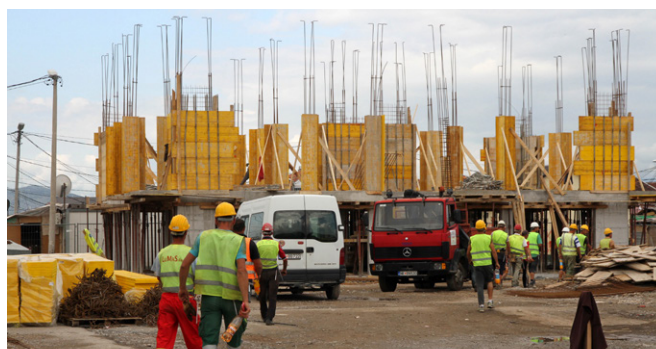
Progress of works in Konik Camp, Montenegro

Beneficiary selection in Bosnia and Herzegovina is well advanced for all sub-projects, as is the delivery of building material packages and reconstruction of houses. Twenty housing units have already been provided and close to 1 000 beneficiaries are expected to move into their new houses by late 2016. The latest RHP Steering Committee meeting in Sarajevo also presented RHP Donors and other stakeholders with an opportunity to visit some RHP beneficiaries in Novo Gorazde.