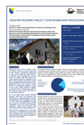
Bosnia and Herzegovina View PDF