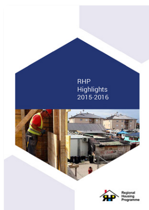
RHP Highlights 2015 - 2016 View PDF