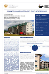
Montenegro View PDF