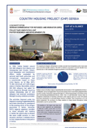
Serbia View PDF