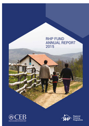
RHP Fund Annual Report 2015 View PDF

In May and June 2016, several publications were issued: