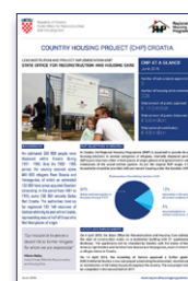
Croatia View PDF