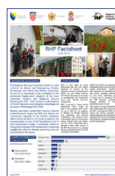
RHP Regional Factsheet View PDF