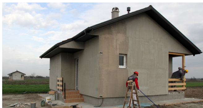
Pre-fab house in Simanovci, Serbia

In Croatia , after the successful completion of the project in Korenica, three more construction sites are now active in Glina (reconstruction of a home for 75 elderly and disabled persons), Knin (construction of two residential buildings with 40 apartments) and Benkovac (construction of an apartment building for 21 families). Furthermore, Croatia has already purchased 58 apartments under the project HR4, targeting the purchase of flats for 101 beneficiary households. As of today, 87 housing units have been provided to beneficiaries in Croatia, and another 50 are expected to be completed by the end of the year.