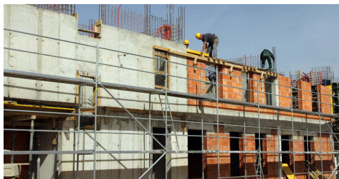
Progress of works in Glina, Croatia

Montenegro is moving forward with RHP construction projects in three main towns – Niksic, Konik and Pljevlja. In Niksic, the construction of two apartment buildings to accommodate 62 vulnerable families was finished in May and the flats were handed over in June. The construction of 120 apartments in Konik Camp was launched in March 2016, with an estimated completion date within the 2nd half of 2017, while the inauguration of the construction site in Pljevlja was officially marked at the end of June.